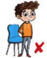
Don't stand up!