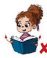
Don't close your book!