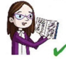
Read the text!