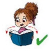
Open your book!