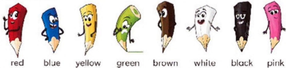
red blue yellow green brown white black pink